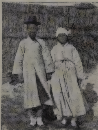
NATIVE PASTOR AND HIS WIFE AT HAIJU

lousness. The ancient question, "Am I my brother's keeper?" would be answered by the typical Korean with an emphatic negative. Probably the native family system is responsible for this. Men recognize that they are united by the ties of kindred, but the broader ties of humanity are little known. One of the most helpful results was a deepening among the Christians of the sense of responsibility for the welfare of others.